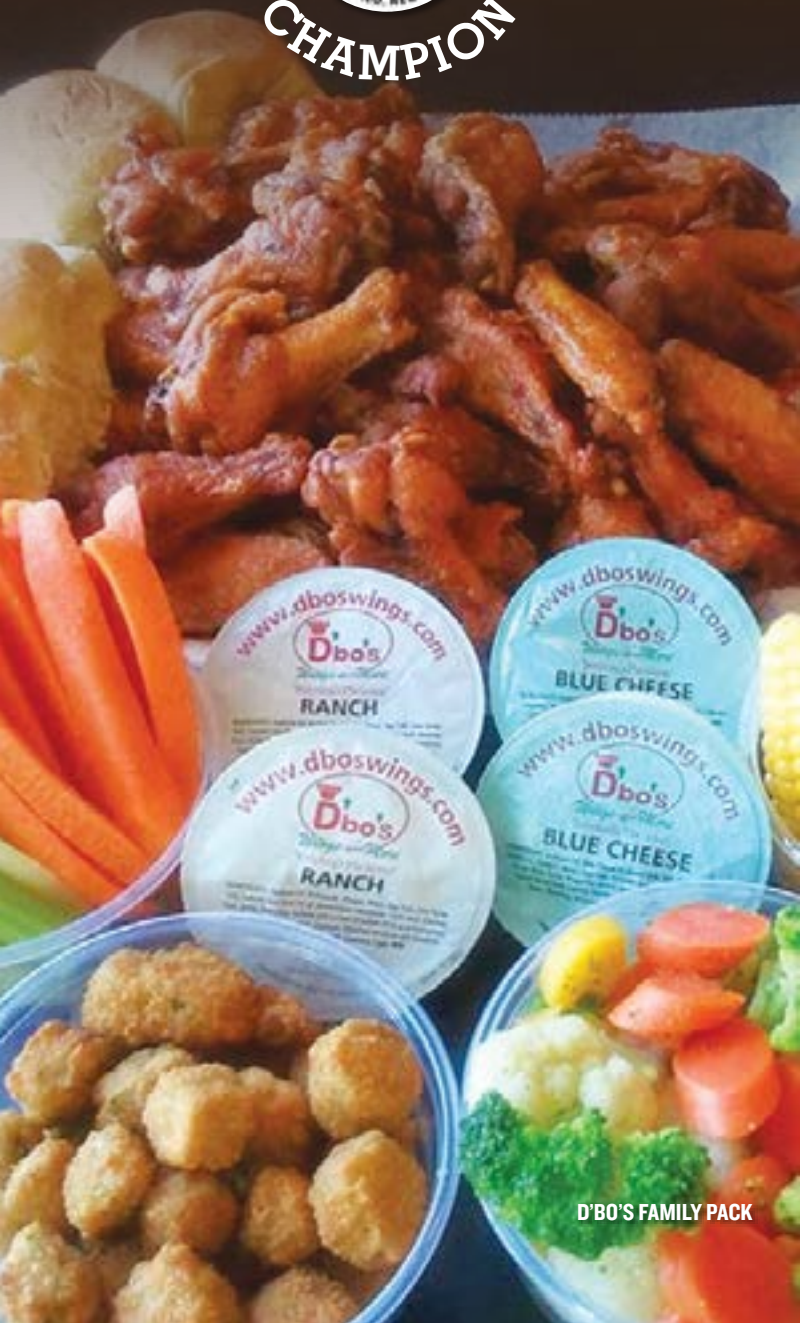
D'BO'S FAMILY PACK